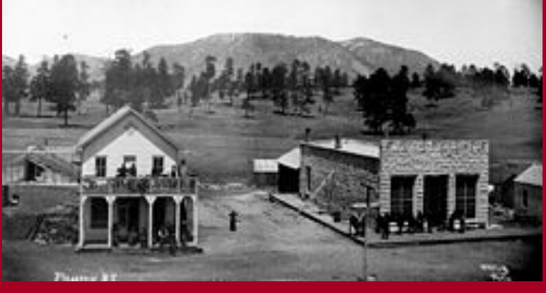
Terrace Street, about 1899, Post office and other buildings.

Route 66 was completed in 1926, and ran through Flagstaff. This opened a massive tourism boom, going east-west (mostly west!), but also allowing visitors to easily get to the nearby Grand Canyon. Flagstaff now had many other attractions, including the world famous Lowell Observatory (where Pluto was first seen, in 1930), the Flagstaff Symphony, Northern Arizona University, and the National Monuments in close proximity. All this, and the largest Ponderosa pine forest in the world next door, and you have the makings of a great place to live.