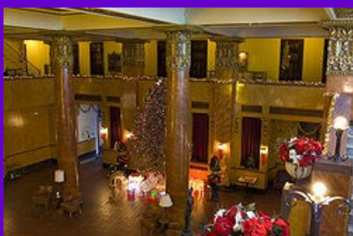
Lobby of the Gadsden Hotel

Douglas also has a history of cattle ranching and agriculture, which continues through today. This is also Cochise County, which was historically home to Cochise, Geronimo, Wyatt Earp, and Doc Holliday, to name some; there are many locations in the mountains (Chiricahuas) and grasslands of Cochise County, where the stories involving these historical figures played out.