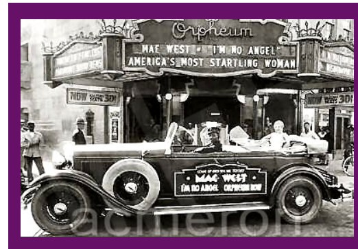
The Orpheum Theater opened in Jan. 1929 - a couple months before the start of the Great Depression.

World War II saw military installations spring up throughout the Southwest. Airmen were trained here in large numbers, since our flying weather was so good. Internment camps for prisoners of war were also established in the Phoenix area. All these new people would later contribute to Phoenix's next growth spurt.