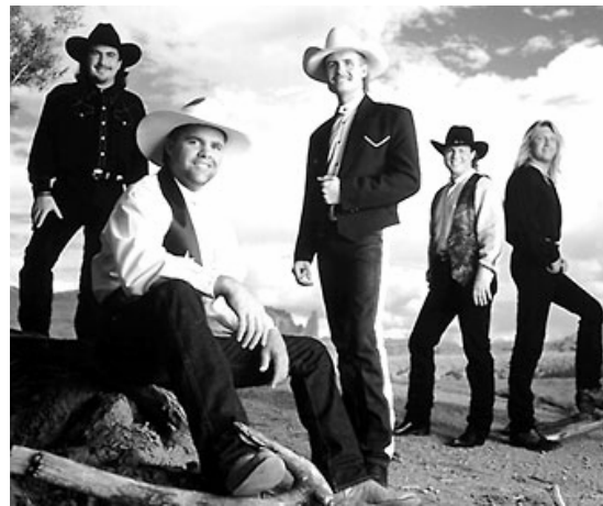
LoneStar in Phoenix and Tucson