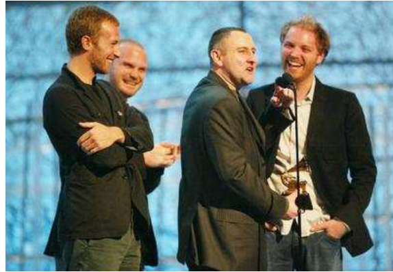
ColdPlay at 2004 Grammy's

Ahwatukee by morning I'll just sleep here on this grate.