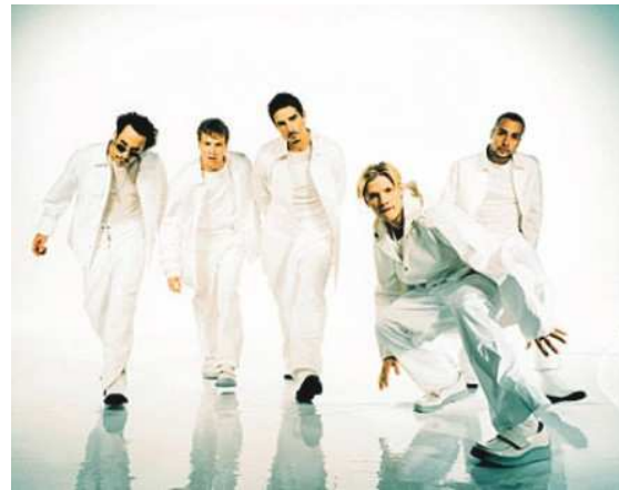
The Back Street Boys are Back