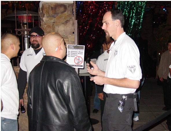
Coach and Willies on a Saturday Night