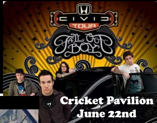
Cricket Pavilion June 22nd