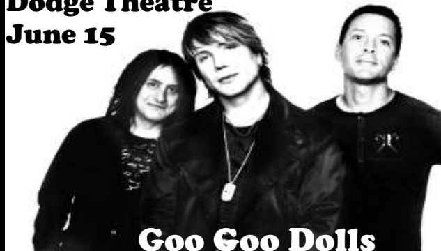
Goo Goo Dolls