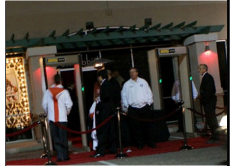
T.E.A.M. at JackRabbit during the NBA

DEAR FRANKIE: My girlfriend and I joined T.E.A.M. together about 6 months ago. We have had a lot of fun while working here. Unfortunately, we are having some problems. We were working a sorority party last weekend and while I was working I got a couple of phone numbers. (It was awesome, I was a stud)...but my girlfriend was also at the event, so needless to say things have become...."bad". I don't want to quit, and she won't quit, so how do I go about making sure that we are not scheduled on the same shift anymore? DON JUAN DEAR DON: Although I'm impressed that you can still pull numbers from college girls at your age, our company Fraternization policy states: "Do not use your position to solicit dates, phone numbers, or romantic encounters". Ad-