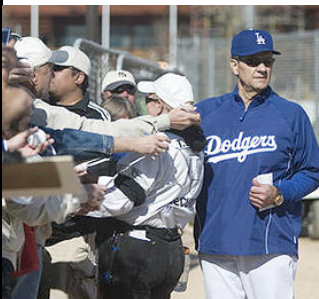
T.E.A.M at Camelback Ranch Spring Training